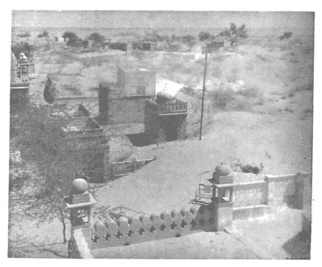
F.g. 4. Shifting sand dunes engulfed buildings Udaramsar, Bikaner

Techniques have been evolved for stabilization of shifting sand dunes by this Institute and over 1000 Ha sand dunes in different agroclimatic regions of Western Rajasthan have been successfully stabilized. For stabilizing the sand dunes we have to adopt the following processes (i) protection against biotic factors by fencing (ii) creation of micro-wind breaks from crest down to the heel of the dune against the prevailing wind direction (iii) planting trees and grasses in between the microwind breaks to provide a vegetative cover.