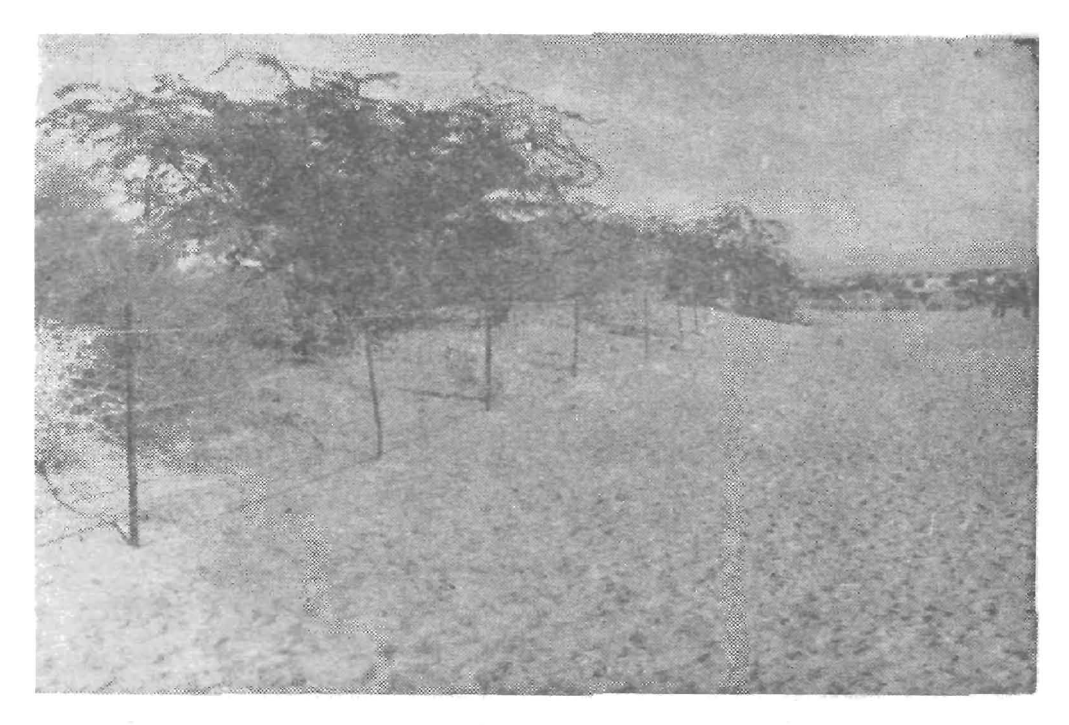
Fig. 6. Unstabilized (right) and stabilized (left) sand dunes and the effect of fencing. Barmer (Rajasthan)

(f) Road side plantations : Road side avenue plantations along the main high ways to the extent of over 200 km were established by this Institute with different tree species. The technique consisted of planting 3 staggered rows of trees on either side of the road.