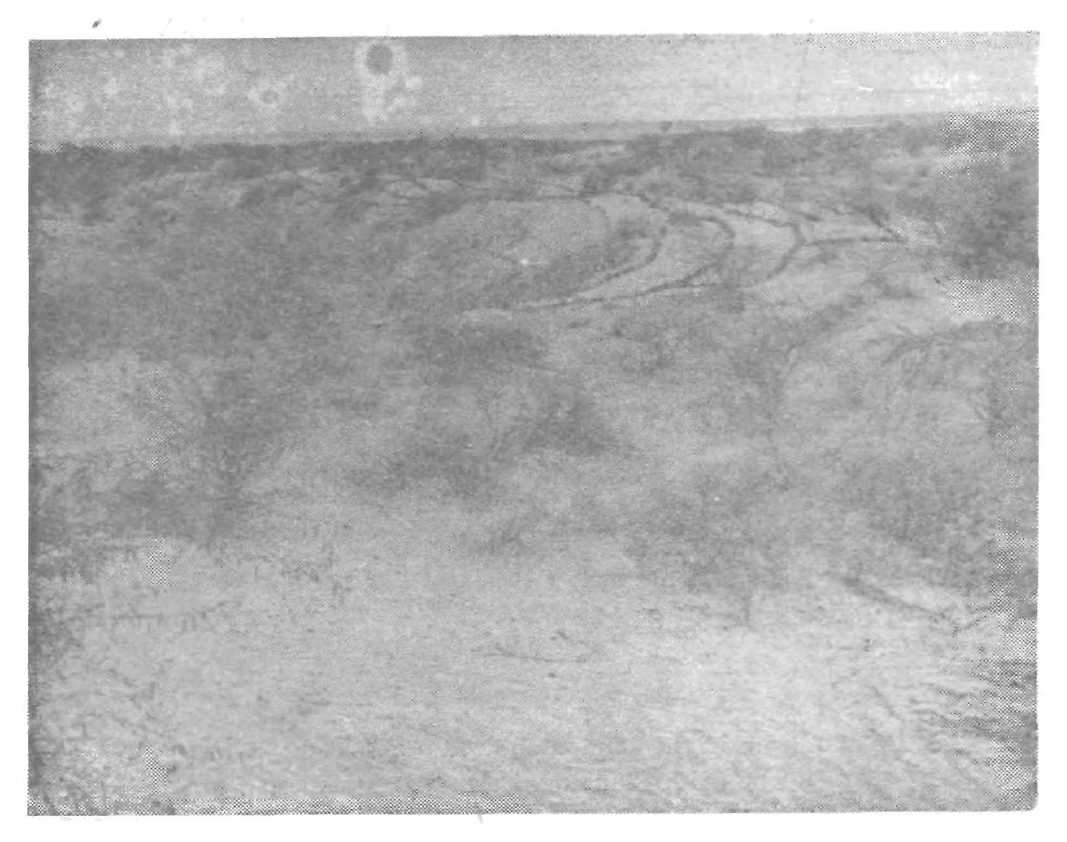
Fig. 5. Sand dune stabilization work in progress-Udaramsar, Bikaner