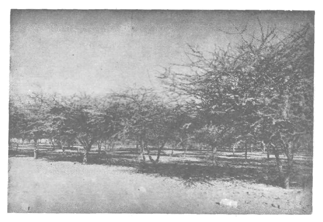
Fig. 2. Acacia tortilis plantation in CRF, Jodhpur

(a) Sandy plains: These sites comprise of deep sandy soils having soil depth ranging from 70 to 150 cm with concur pan beneath. Soil working in such areas need not be done well in advance of planting as it would affect the soil moisture build up. Planting pits of 60 \times 60 \times 60 cm, should be dug out and half filled with the loose weathered soil before planting with the onset of rains in the months of July. Sturdy seedlings of 9 to 10 months old, raised in Galvanised iron containers or polythene bags, should be planted in the pits provided with saucer like depressions around the plants in plains or crescent shaped ridges of 15 cm high are formed across the local slope if planting is to be done on slopes so as to arrest the run off water during monsoons.